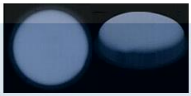
Fiber endface pr